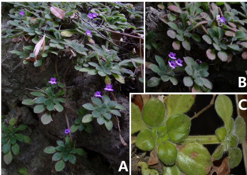
Fig. 3. Primulina diffusa . — A: Habit. — B: Stolons and flowers. — C: Close-up of plant with stolon.