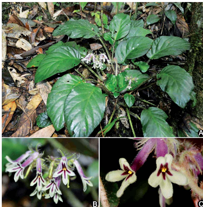
Fig. 1. Oreocharis jinpingensis in the field (all from the holotype; A and B photographed by Zhi-Yong Yu, C by Yu-Min Shui). — A: Plant. — B: Inflorescence. — C: Face view of corolla.

in broad-leaved forests, 22°35'24.45"N, 102°53'41.57"E, alt. 2000 m, 13 July 2011, in fruit, Y.M. Shui et al. 90996 (KUN!).