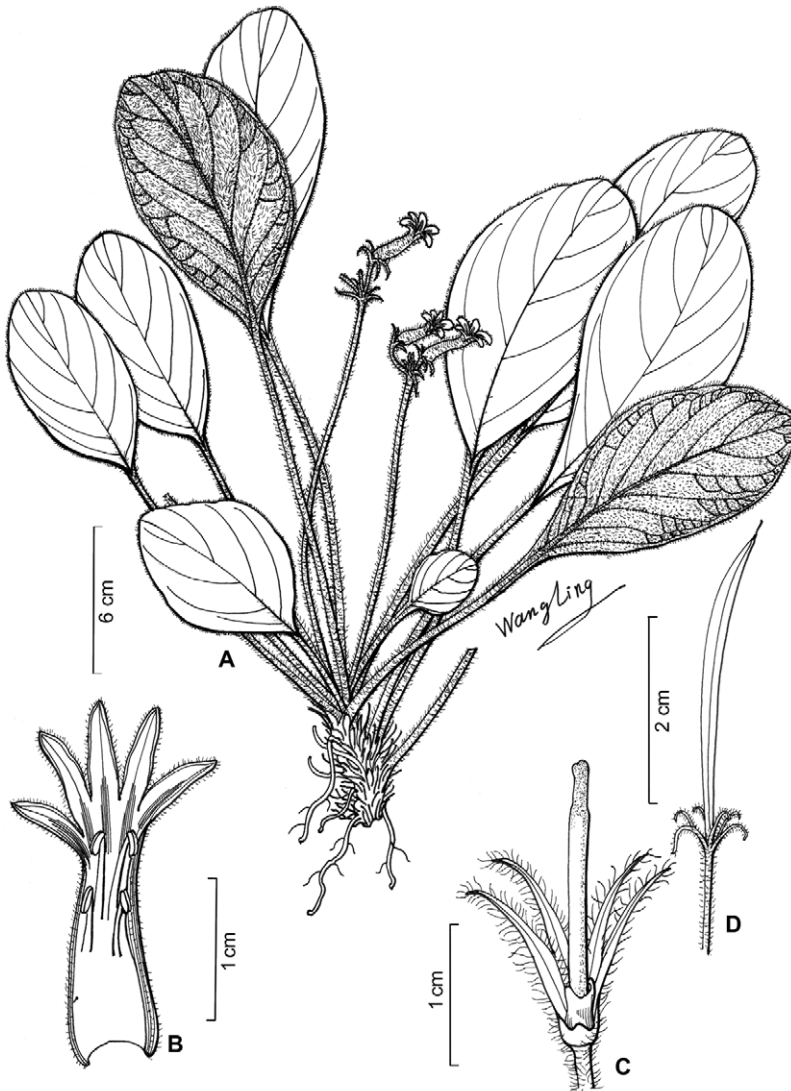
Fig. 2. Oreocharis jinpingensis (A–C from the holotype, D from Y.M. Shui et al. 90996, drawn by Ling Wang). — A: Plant. — B: Opened corolla. — C: Calyx, ovary and disc. — D: Dry fruit.

mossy evergreen broad-leaved forests, at altitudes of 2000–2048 m a.s.l. in Jinping County of SE Yunnan, China, bordering northwestern Vietnam.