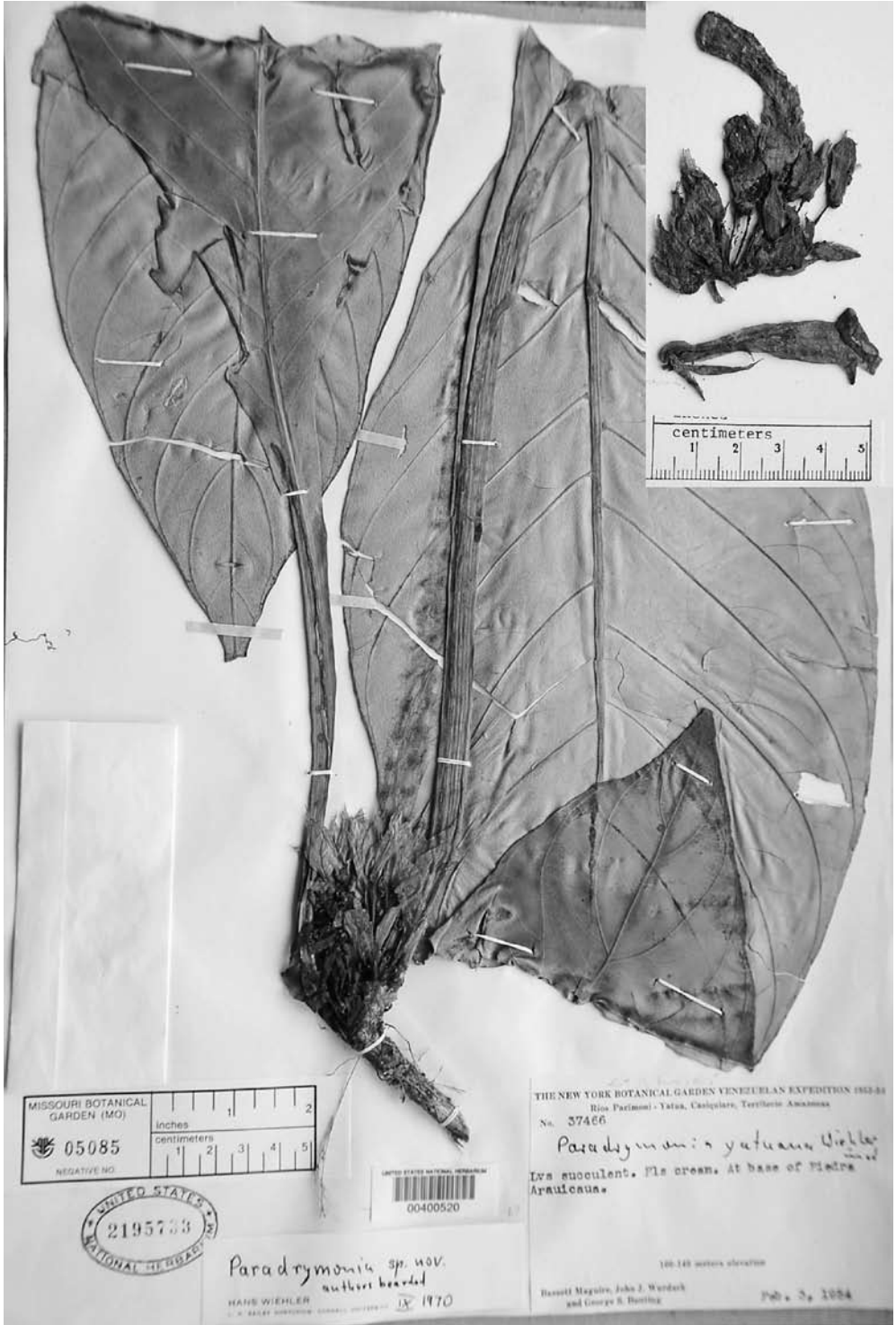
Fig. 5. Paradymonia yatuana , Maguire, Wurdack & Bunting 37466 (holotype: US); flower inset, Steyermark & G.S. Bunting 102546 (US).