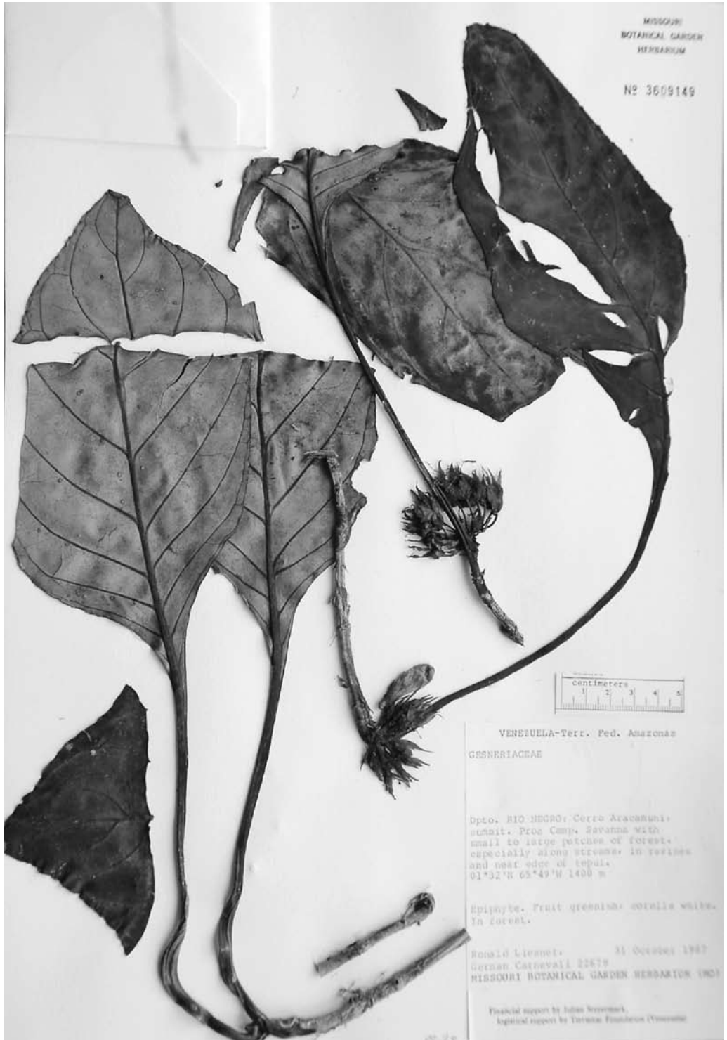
FIG. 4. Paradrymonia tepui , Liesner & Carnevali 22679 (isotype: MO).