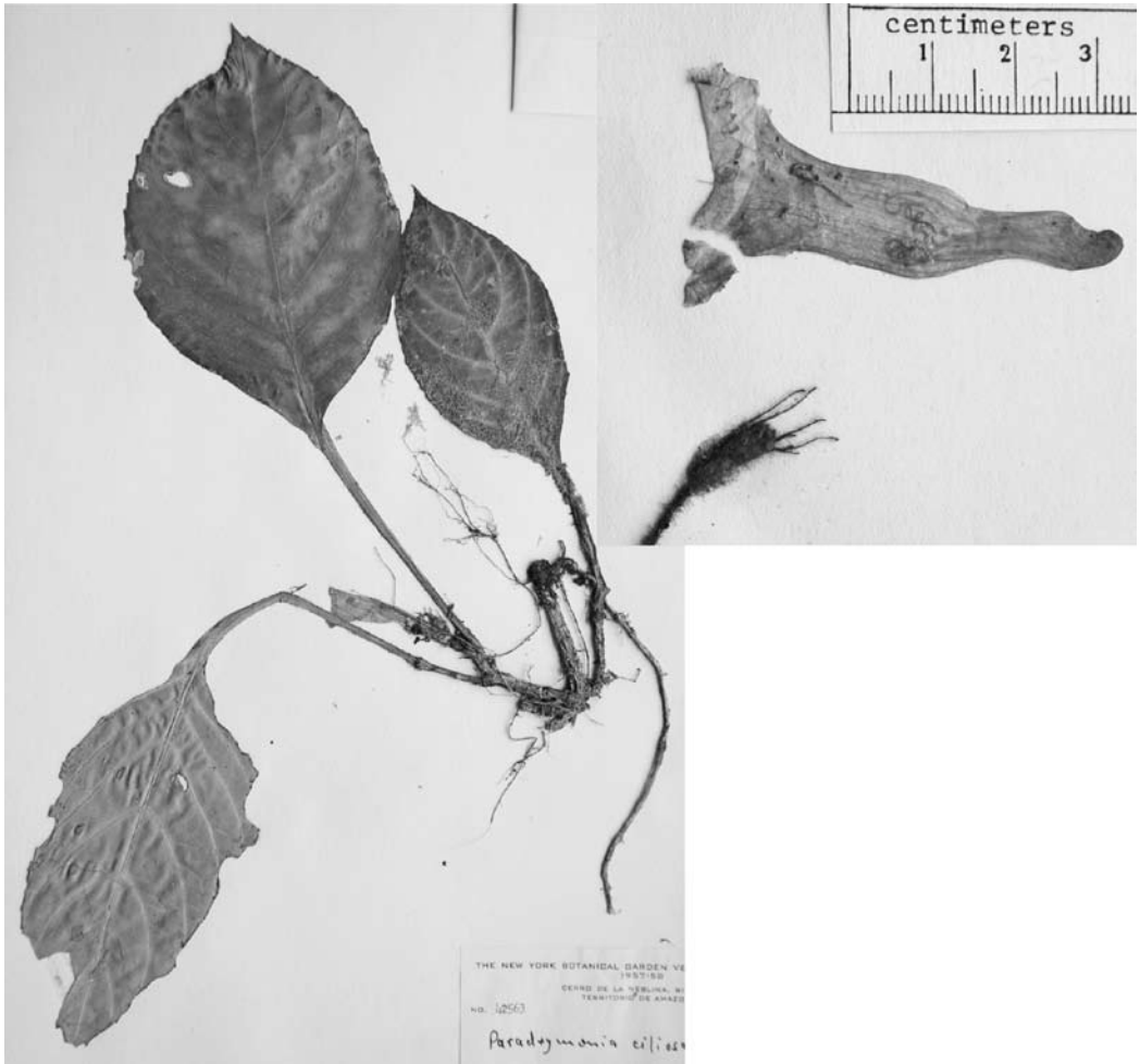
FIG. 2. Paradymonia hamata , Maguire, Wurdack & Maguire 42563 (holotype: NY), blade of the middle leaf 9.5 cm wide; corolla & bud inset, B. Maguire, R.S. Cowan & J.J. Wurdack 30621 (NY).

pubescent to glabrous, 15–38 cm long; blade broadly ovate to ovate elliptic, 13–32 × 6–21 cm, cuneate and shortly decurrent at base, abruptly acuminate at apex, margins obscurely and loosely glandular serrate, glabrous, sometimes the veins sparsely appressed-pubescent abaxially, margin sparsely ciliate, with 9–13 main veins on each side of the midrib, impressed adaxially, conspicuous abaxially, tertiary venation not evident. Inflorescences axillary, fasciculate or short pedunculate, 12–25-flowered, peduncle 3–5 mm long, appressed-pubescent, bracts oblanceolate or lance-elliptic, acute at apex, 10–12 × 1.5–3 mm, minutely appressed-pubescent, pedicels densely appressed-pubescent, 2–3 cm long. Flower: calyx lobes free, 15–25 × 3–6 mm, narrowly to broadly lanceolate or lance-elliptic, narrowed to an acuminate attenuate apex, endured at the tip, sparsely ciliate in the upper half, entire in the basal half, with a few endured blunt teeth toward the apex; corolla bright yellow, tubular, 4.3–4.5 cm long, glabrous inside except for the verrucose throat, pilosulous outside except toward the base, basal gibbosity 3.5 × 5 mm, ovate-oblong, glabrous, base narrowed, broader above to 7–8 mm diam., lobes suborbicular, 6 × 7 mm, glabrous inside, ventral lobe appressed-pilose outside, the others appressed-pilose toward base, otherwise glabrous outside; stamens