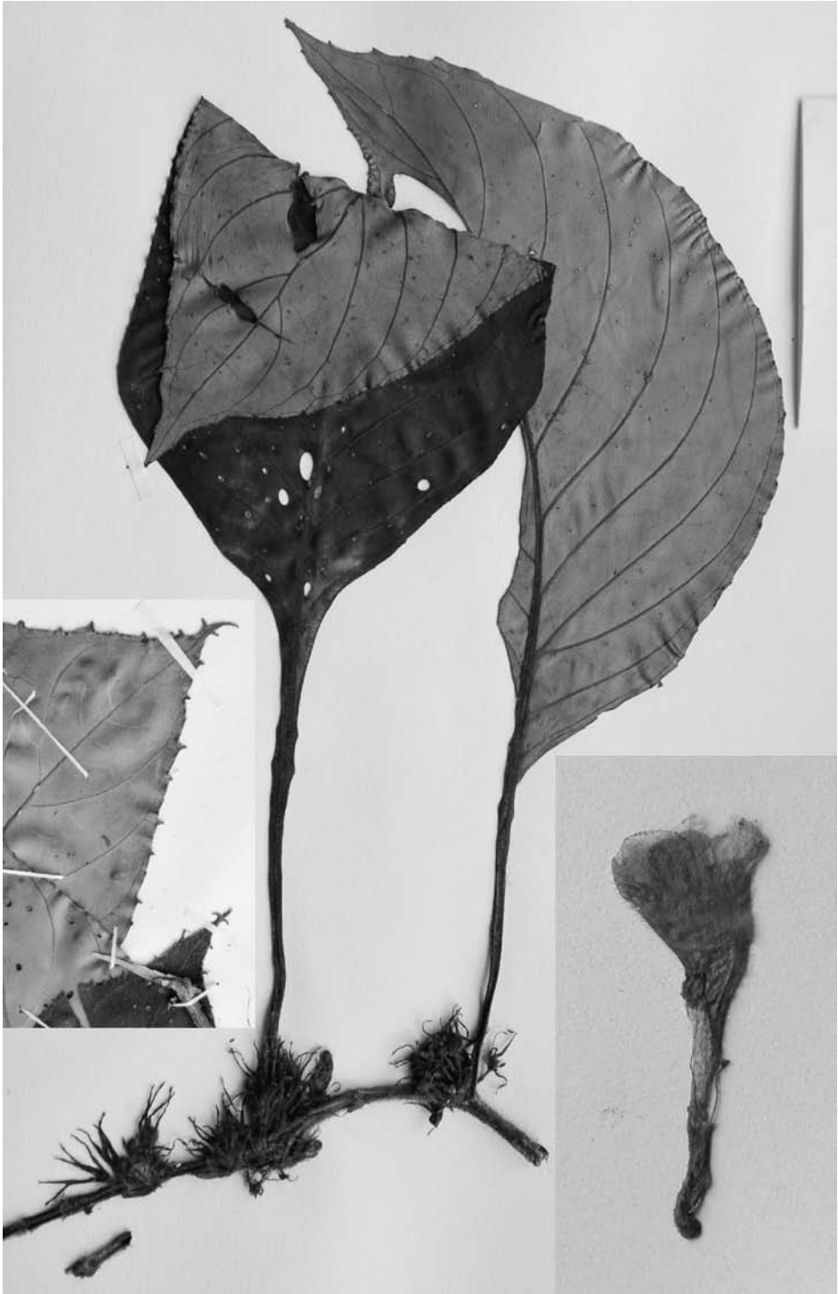
FIG. 1. Paradyrmonia glandulosa , Steyermark & Holst 130443 (isotype: MO), shorter distance between the 2 petioles = 6 cm; leaf margin inset, idem (US), length of the inset = 12 cm; corolla inset, Maguire, Cowan & Wurdack 30657 (NY), total length of the object = 3.5 cm.