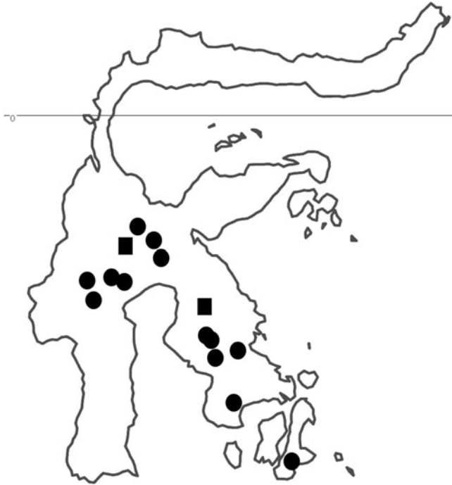
FIG. 2. Distribution map of Rhynchoglossum capsulare Ohwi ex Karton. (■) and the Sulawesi distribution of Codonoboea kjellbergii (B.L.Burt) Karton. (●).

Etymology. The specific epithet refers to the appearance of the fruit.