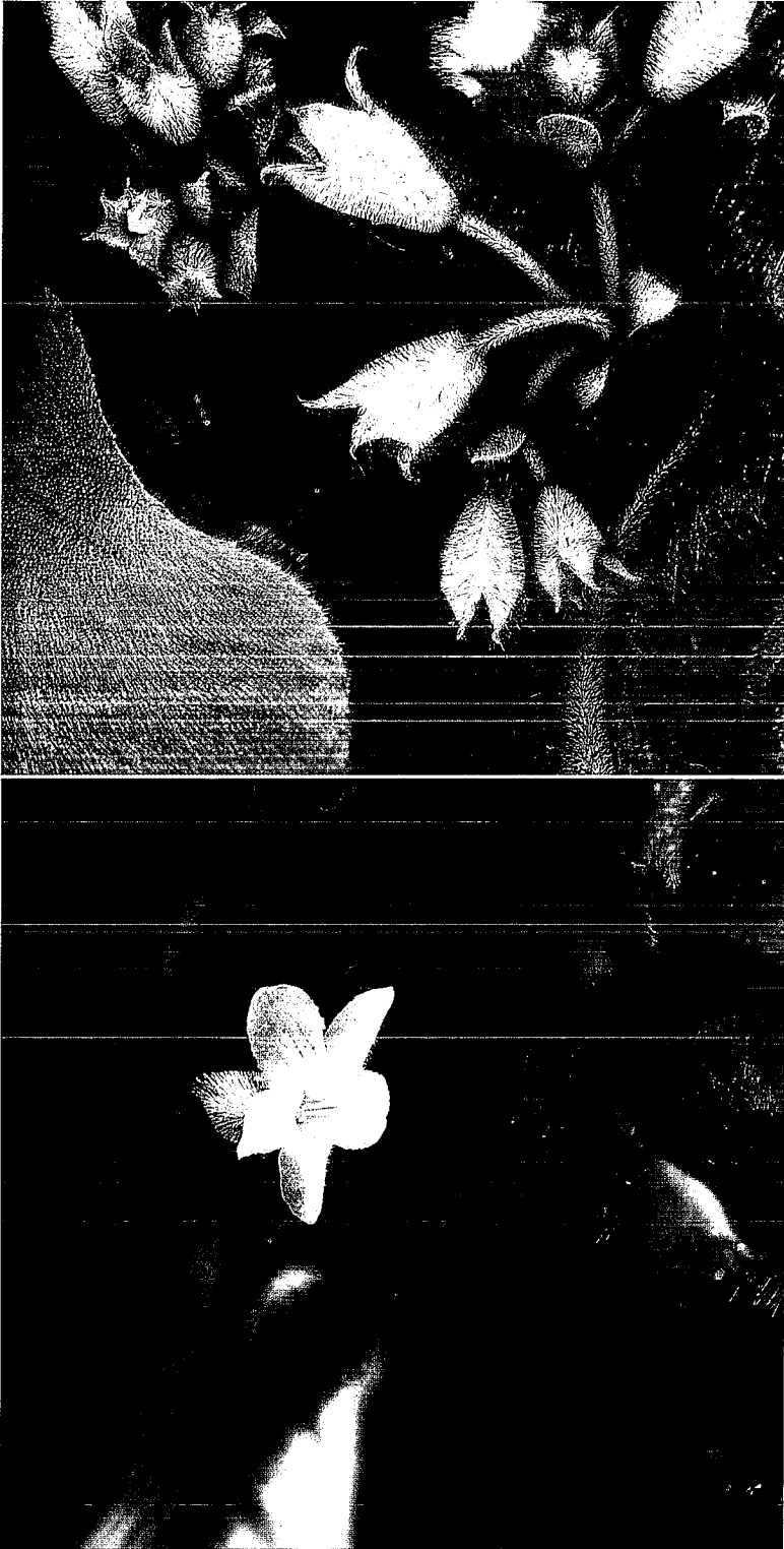
Figure 2. Cyrtandra paliku . —(Left). Corolla. —(Right). Inflorescence, showing calyx configuration post-anthesis.