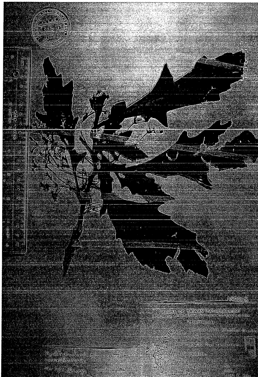
Fig. 2: Rhynchoetechum discolor (Maxim.) Burt var. incisum (Ohwi) Walker (T. Y. Yang 1091, TAI), a new record to Taiwan.