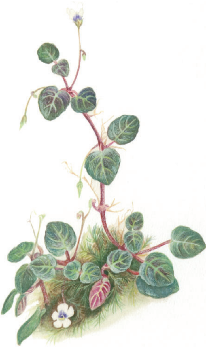
Plate 657 Saintpaulia watkinsii